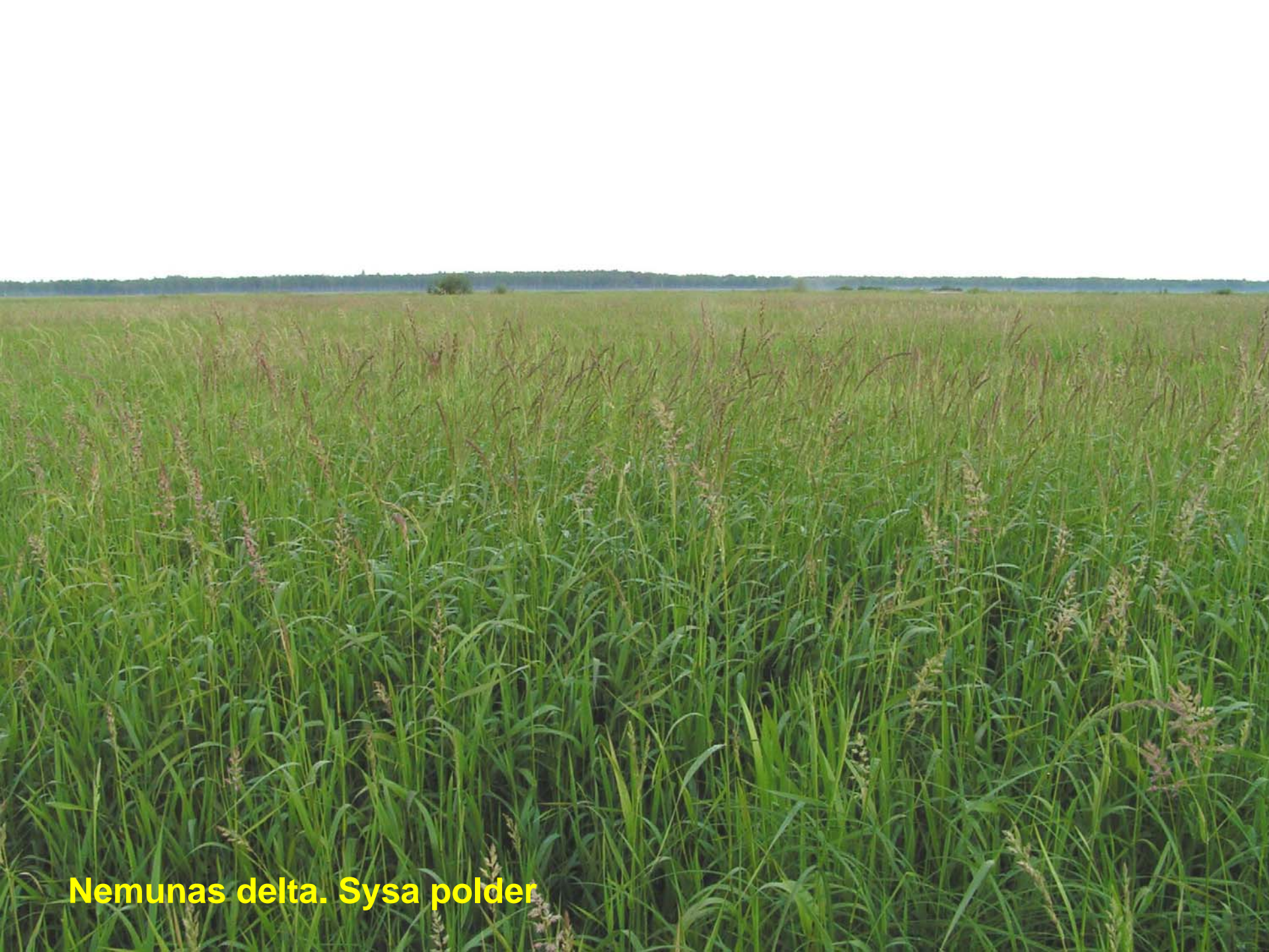
Nemunas delta. Sysa polder