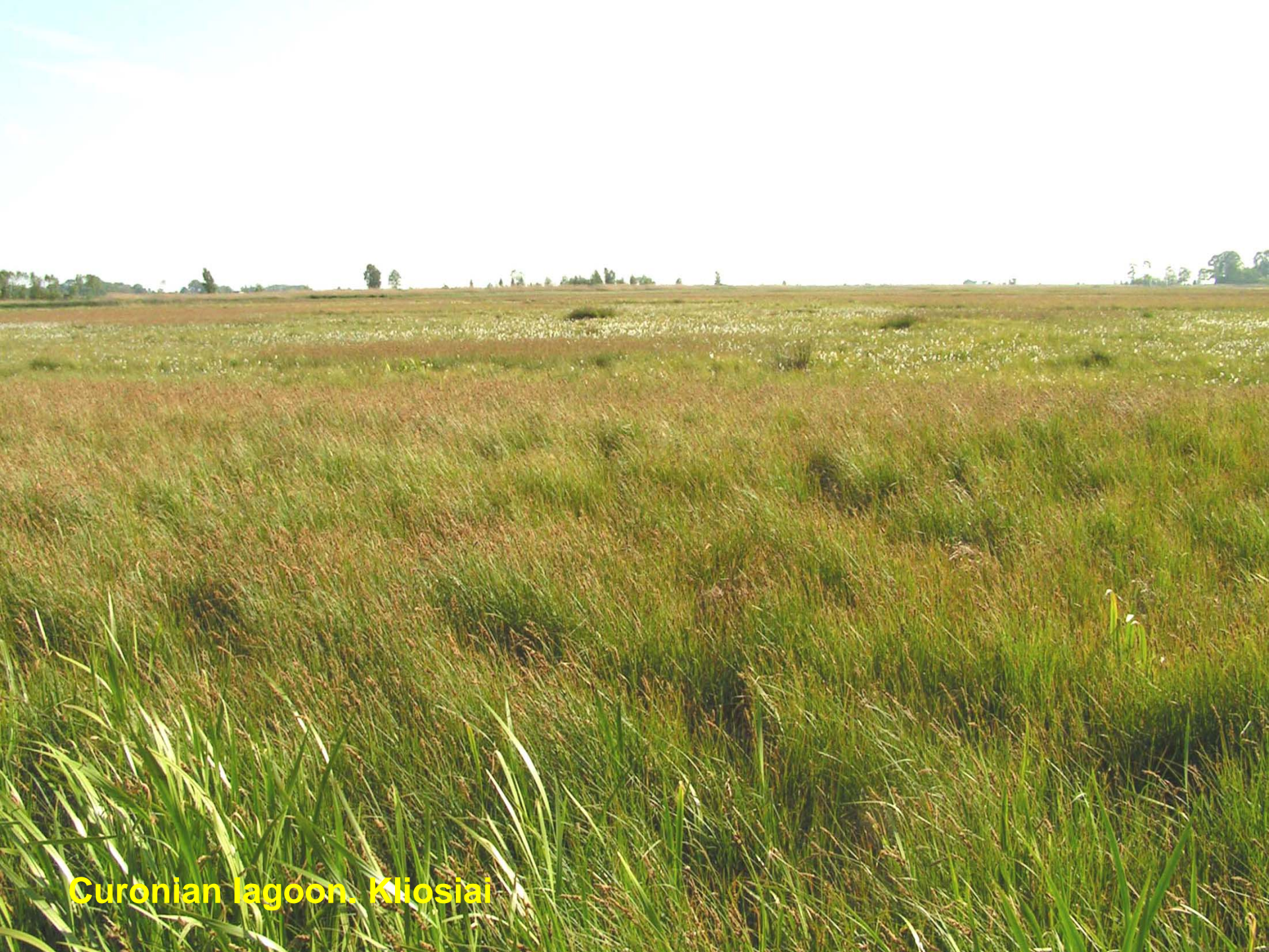
Curonian lagoon. Kliosiai