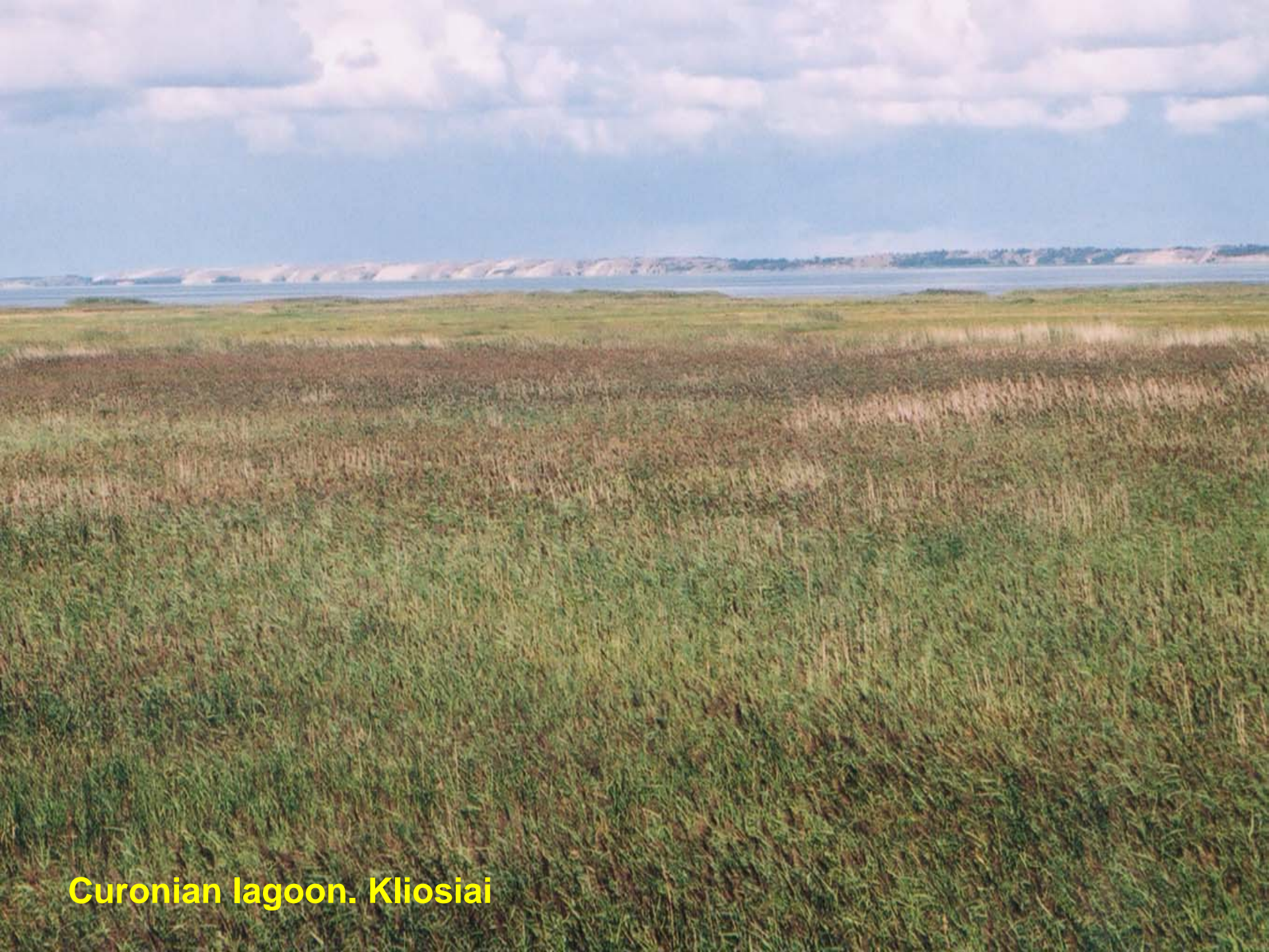
Curonian lagoon. Kliosiai