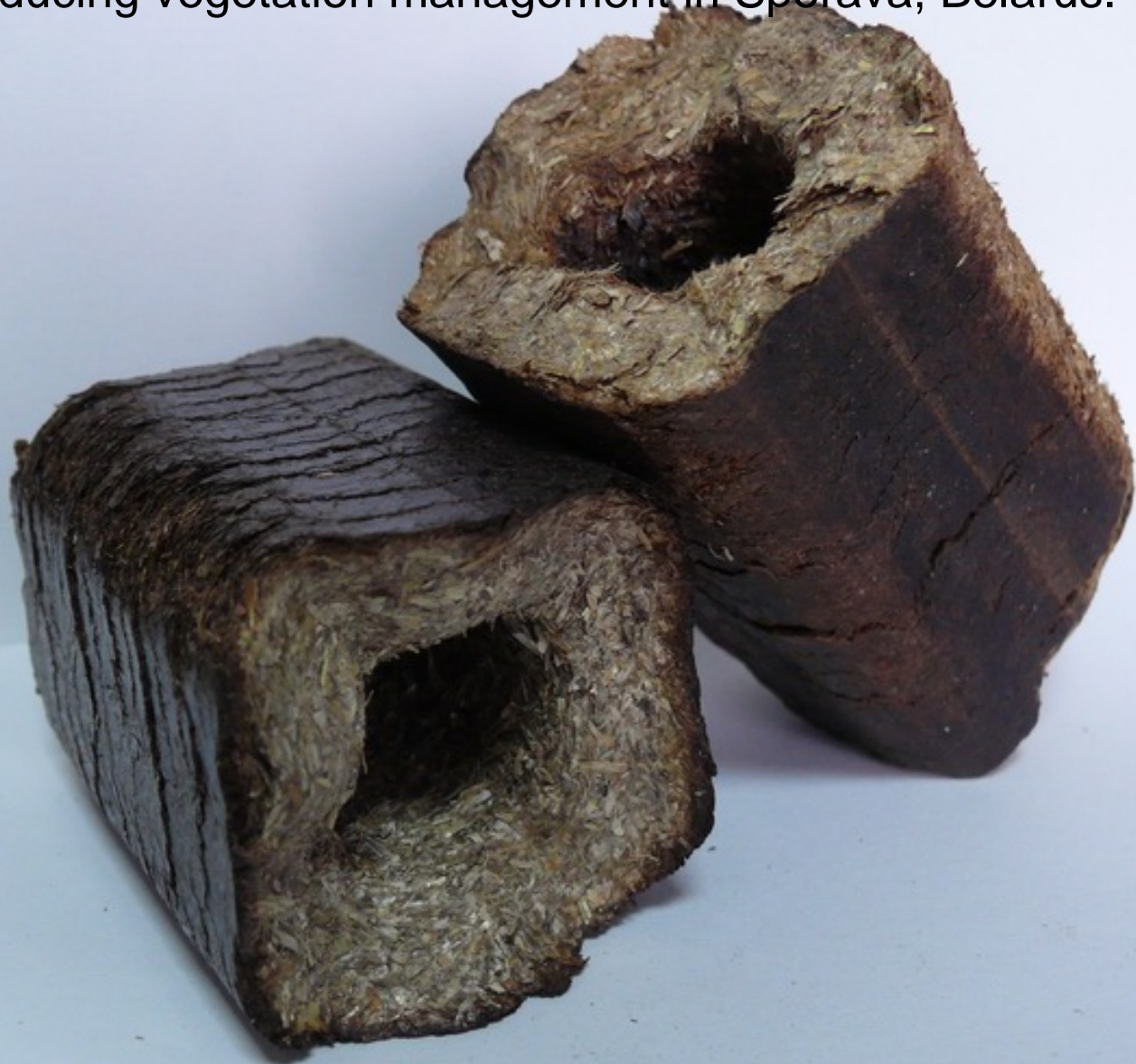
Trial briquettes produced out of biomass harvested in Sporava (2010)