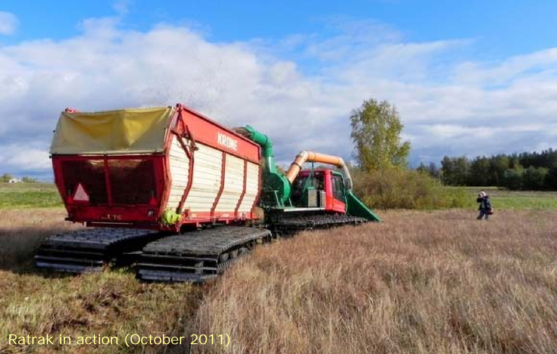
Ratrak in action (October 2011)