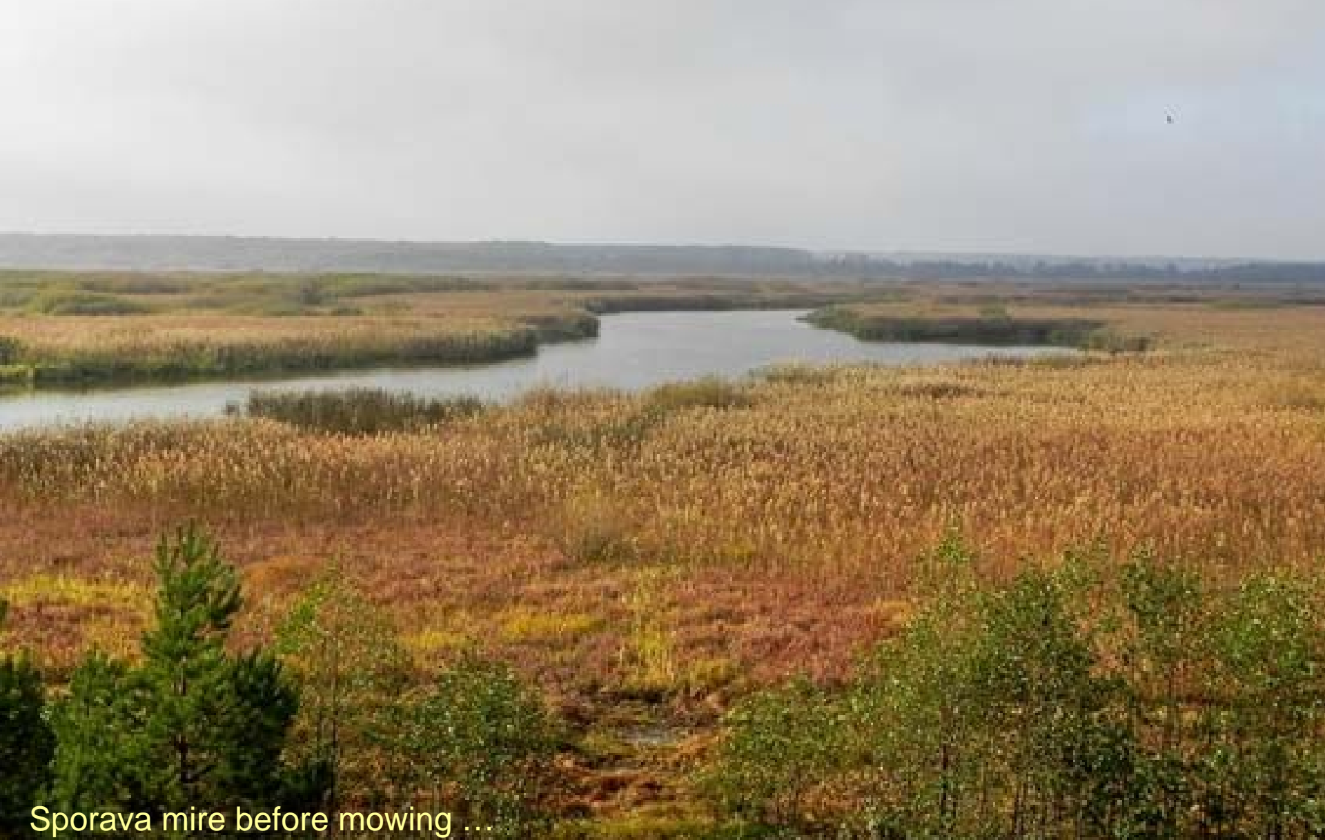
Sporava mire before mowing ...