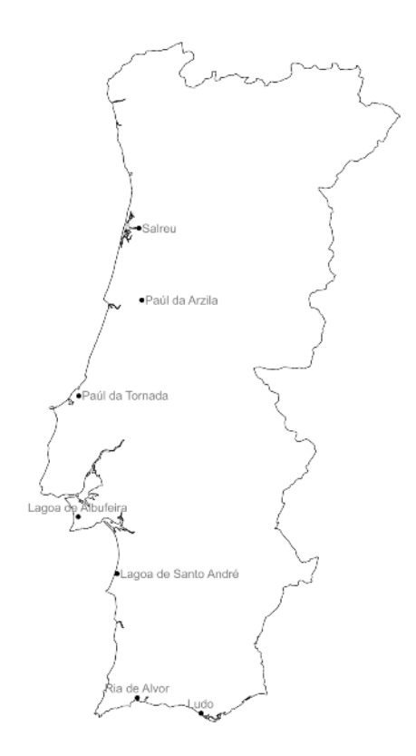
FIG. 1.—Distribution of aquatic warblers in Portugal. [Distribución del carricerín cejudo en Portugal.]

2009 J. M. N. caught four AWs at Salreu using a tape lure (which is twice as many as the previous records for this site; see table 1), strongly supports the idea that a much larger number of birds of this species migrate through Portugal, but are being overlooked.