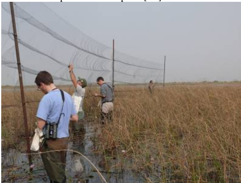
3. Work at the mist net [VF]