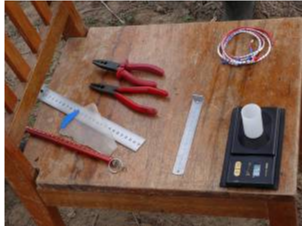
15. Ringing tools [VF]