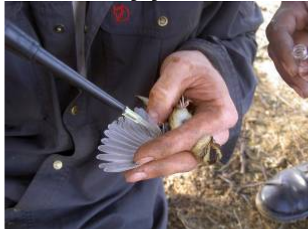
16.-17. Benedikt, taking a blood sample from AW [MF, LL]