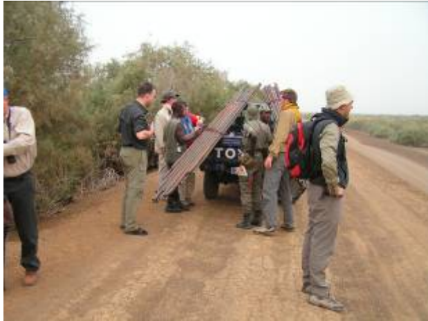
1. Pickup with mist-net poles [ZP]