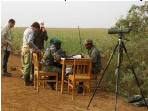
23. Ringing station at TS 6 [MF]