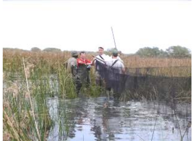
2. Establishing mist-nets in deep water [VF]