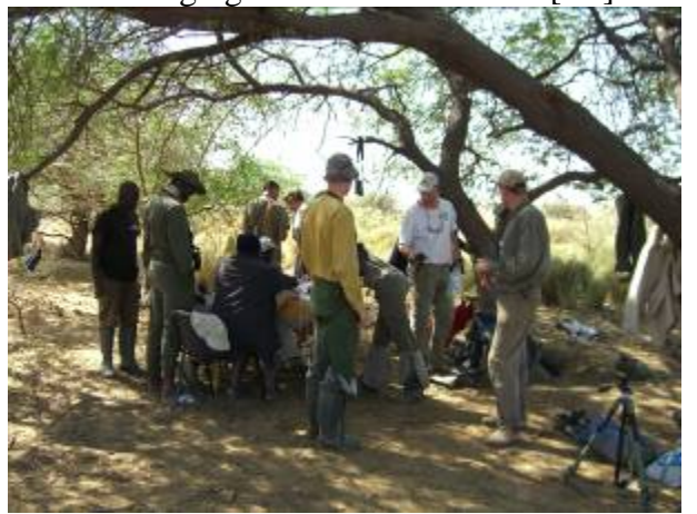
25.-26. Ringing station at Grand Lac, TS 9A-B (near Mirador President)