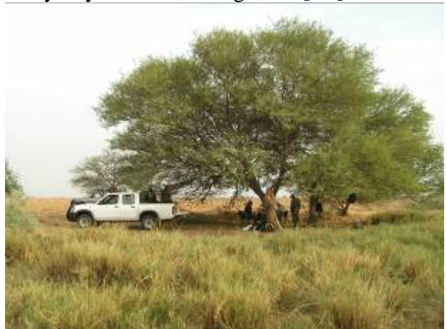
24. Ringing station at Grand Lac [ZP]