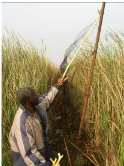
5. Indega, demonstrating the 'Indega Stick' [MF]