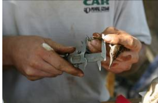
18.-19. Measuring Culmen and Tarsus of a Baillon's Crake [GG]