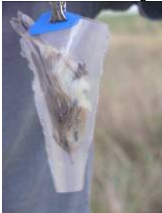
20. Weighing a Sedge Warbler [VF]