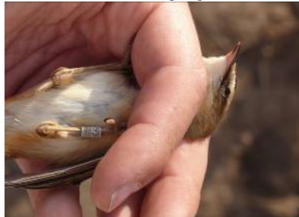
21. Sedge Warbler with Belgish ring [VF]