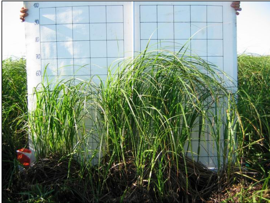
Fig. 3: Past Aquatic Warbler breeding site in the Polish National Park “Warta Mouth”. The Carex gracilis litter layer is 30-40 cm thick. The picture was taken in June 2004.

On the basis of our preliminary results from West-Pomeranian breeding sites and of literature data, the following management recommendations for Aquatic Warbler conservation in Western Pomerania are identified: