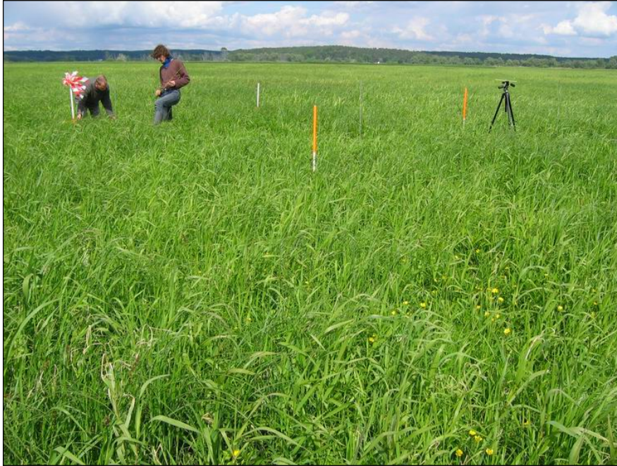
Fig. 3: Aquatic Warbler breeding site in the German National Park “Lower Odra valley”. The picture was taken in June 2004 during fieldwork.

In the Lower Odra valley, Aquatic Warbler breeding habitats have a mixed vegetation of sedges and grasses with as dominant species Calamagrostis canescens , Carex gracilis , C. riparia , and Phalaris arundinacea (sites nearby the Polish Landscape Park “Lower Odra valley”) or Carex gracilis , Phalaris arundinacea , and Glyceria maxima (most sites in the German National Park “Lower Odra valley”) (Fig. 3). Some sites in the German National Park “Lower Odra valley” and in the Polish National Park “Warta mouth” almost exclusively consist of Carex gracilis reeds. All currently used sites were mown in previous years. Many formerly inhabited but currently abandoned sites are no longer being mown (e.g. German National Park “Lower Odra valley”, Polish Landscape Park “Lower Odra valley”, and Polish National Park “Warta mouth”).