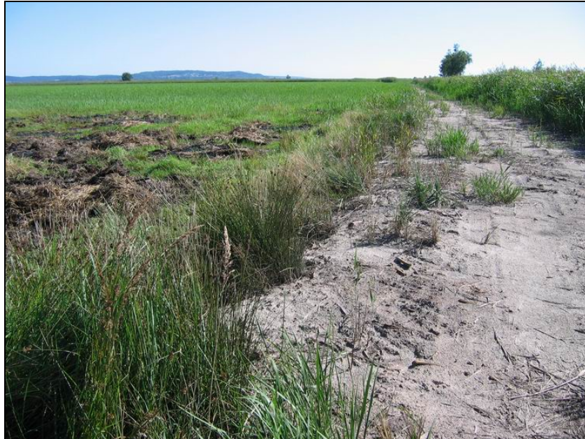
Fig. 2: Aquatic Warbler breeding site on Kasiborska Kępa, Poland. The area to the left is a Phragmites communis reed used for summer-cutting, the one to the right is used for winter-cutting. The picture was taken in September 2004.

The coastal habitats predominantly consist of scantily growing Phragmites australis reeds under different types of use: Summer and winter cutting reed with sparse sedges (e.g. A. acutiformis ) at Kasiborska Kępa (Fig. 2), cattle grazed reed in the Świna delta, summer cutting reed hindered by late frosts with a dense Thelypteris palustris ground layer at Rozwarowo, cattle grazed brackish grasslands with scattered, low reeds on the Freesendorfer Wiesen (Sellin 1989).