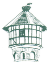
Storchenclub (storkclub) Rühstädt – Germany