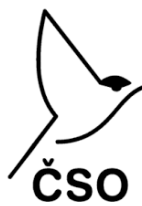
Czech Society of Ornithology – Birdlife Czech Republic