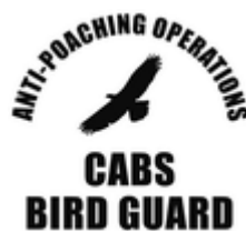
Committee Against Bird Slaughter (CABS) – Germany