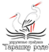
Association of Citizens "Taraš storks" – Serbia