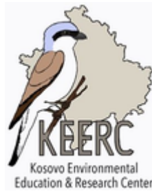
Kosovo Environmental Education & Research Center – Kosovo