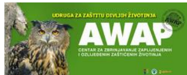
Association for Wild Animals Protection – AWAP – Croatia